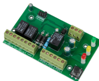
12VMPB MAINS AND MONITORING QUICK FIT REPLACEMENT BOARD